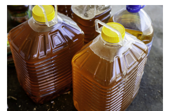
Minyak masak terpakai Used cooking oil