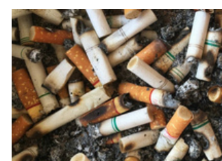
Puntung Rokok Cigarette buds