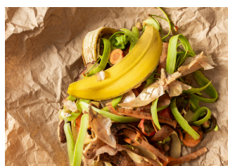
Sisa basah/ dapur Wet/ kitchen waste