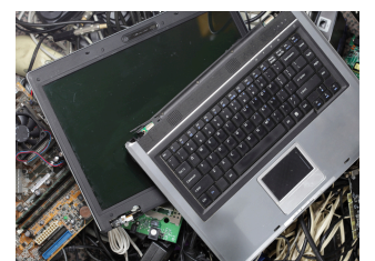
Sisa elektronik Electronic waste