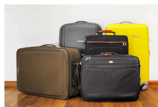
Beg bagasi Luggage bags