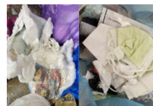
Sisa klinikal Clinical waste