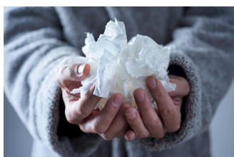
Tisu terpakai Used tissues